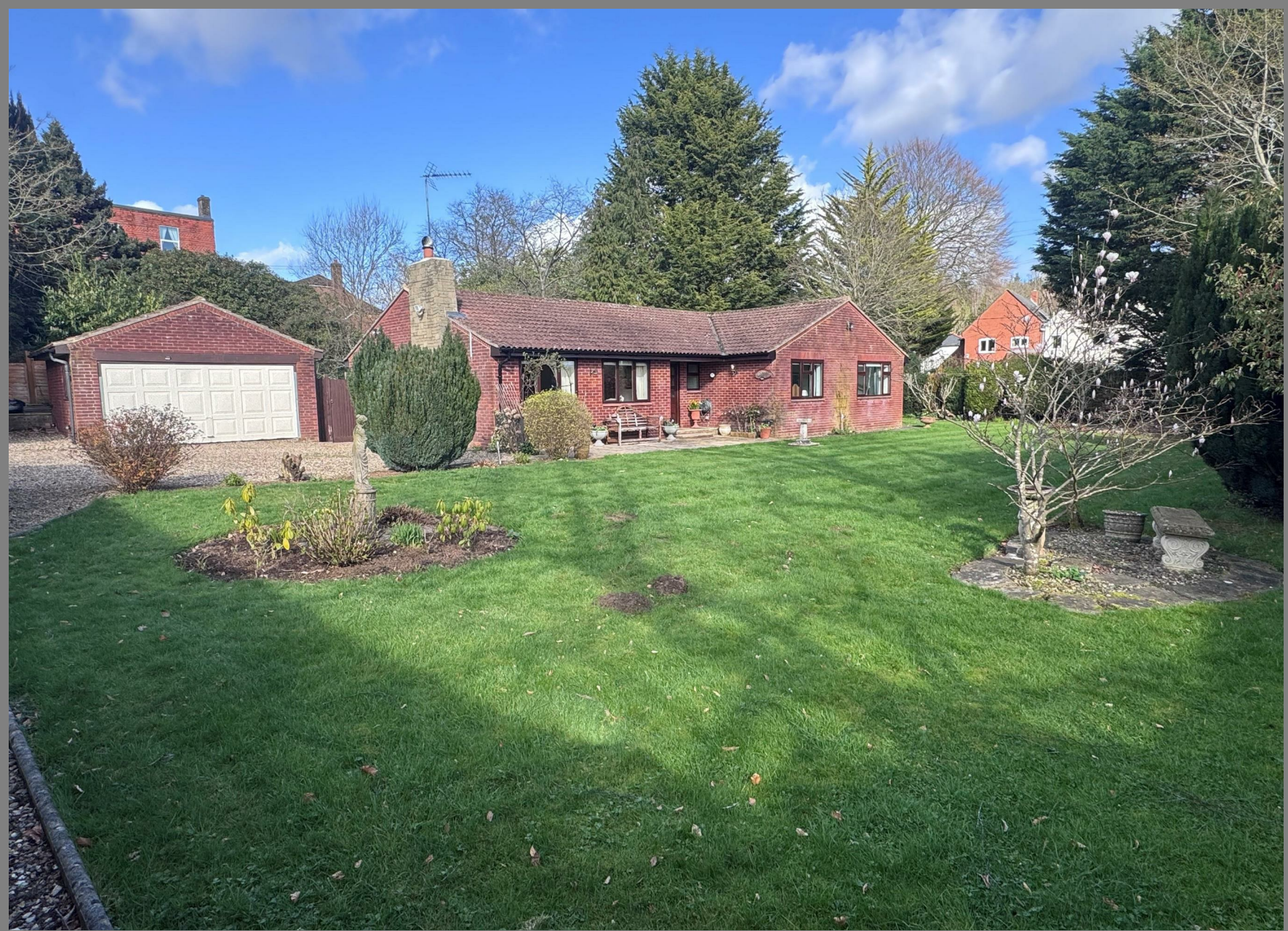
Glendaruel, Wash Water, Newbury, RG20 0LU